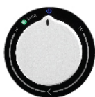
Cirrus Cloud (WH)