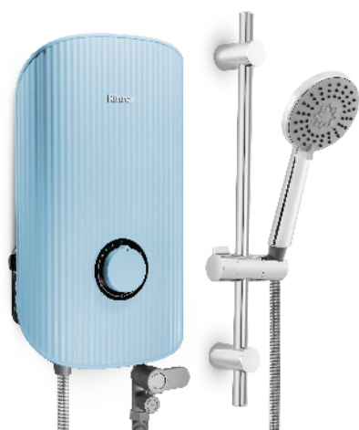
REI-E380DP-C-BL | REI-E380NP-C-BL