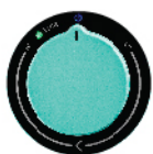
Aqua Turquoise (TQ)