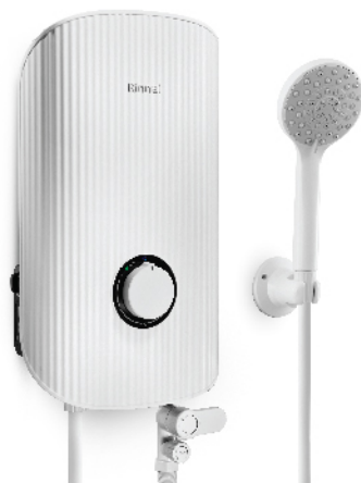
REI-E380DP-B-WH | REI-E380NP-B-WH