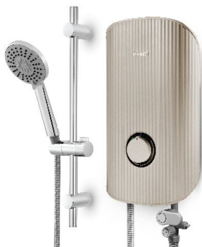
REI-E380DP-C-BG | REI-E380NP-C-BG