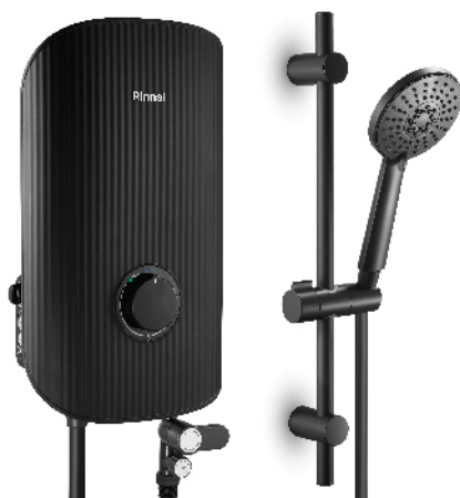
REI-E380DP-BS-BK | REI-E380NP-BS-BK