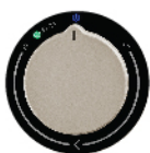
Sandy Beach (BG)