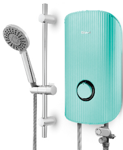
REI-E380DP-C-TQ | REI-E380NP-C-TQ

Available in 5 exquisite colours to blend seamlessly with your bathroom tiles.