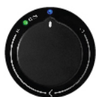
Black Rock (BK)