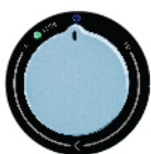
Sky Blue (BL)